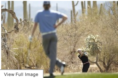
View Full Image